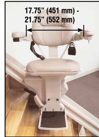
Seat Pad Size: 17.5" (445 mm) wide x 15" (381 mm) deep

Personalized comfort is one of the hallmarks of the Electra-Ride Elite. With armrests that can be adjusted for width requirements, the SRE-2010 standard seat is accommodating and secure. The seat height and footrest height are independently adjustable, assuring a personal fit for unparalleled ease and stability.