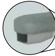
Up/Down Rocker Switch Controls Swivel Seat

Power Swivel Seat will increase the seat height. Please refer to SRE-2010 typical drawings for details.